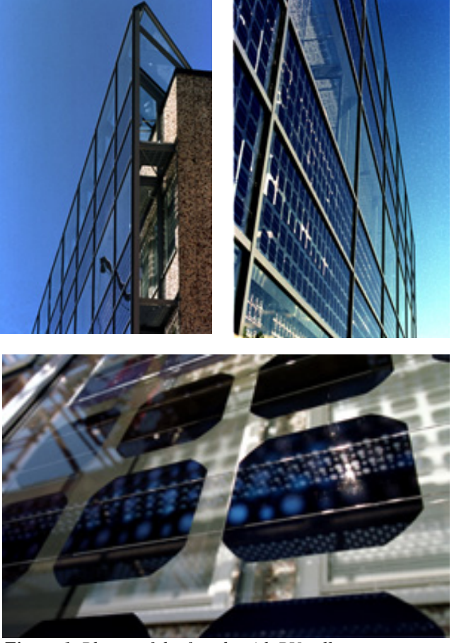
Figure 1. Photos of the facade with PV cells.

The double façade prototype was constructed with glass panels mounted in a standard aluminium framing system. The outer skin is carried by vertical steel frames, these are bolted to the concrete floors of the building. Opengrate steel platforms are installed at each floor level for monitoring, maintenance and cleaning purposes. The cavity can be vented by motor-operated vents at the top and bottom, controlled by temperature sensors.